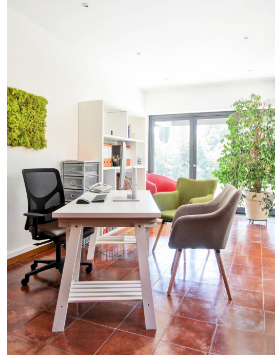
Esterno, Villa, Roma

9 bed | 12 bath | 4 half bath Land area: 45,208 SF | 4,200 m 2 Living area: 12,915 SF | 1,100 m 2 Terrasse: 2,150 SF | 200 m 2 Parking spaces: 15